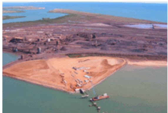
PACE) project for BHP Billiton Iron Ore