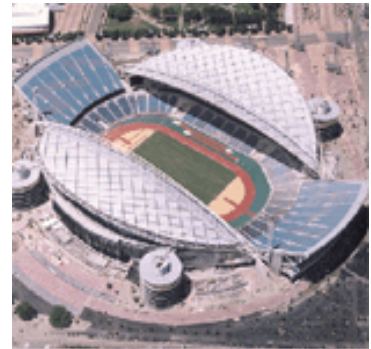
Stadium Australia Olympics 2000